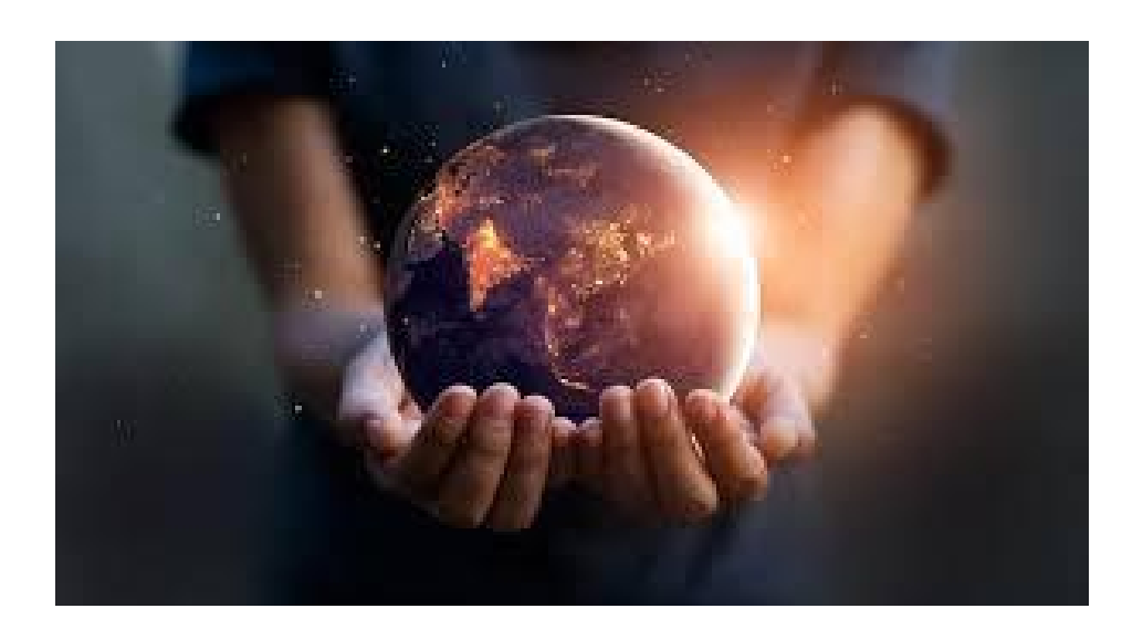
■ The world governments are elected, appointed and employed by their nations who, therefore, have the innate and natural right and authority to state their own opinions and decisions on national and international issues related to them.

establishing better living standards and improving human rights and civil rights; it works for, fosters and secures the nations' wellbeing, welfare, health, social integrity and prosperity and all humanitarian , social, public, civic, socio-economic, cultural and environmental issues making sure that they have the care, affection, amity and respect they deserve while having their voice heard among themselves and across the world, heartily, fraternally and officially.